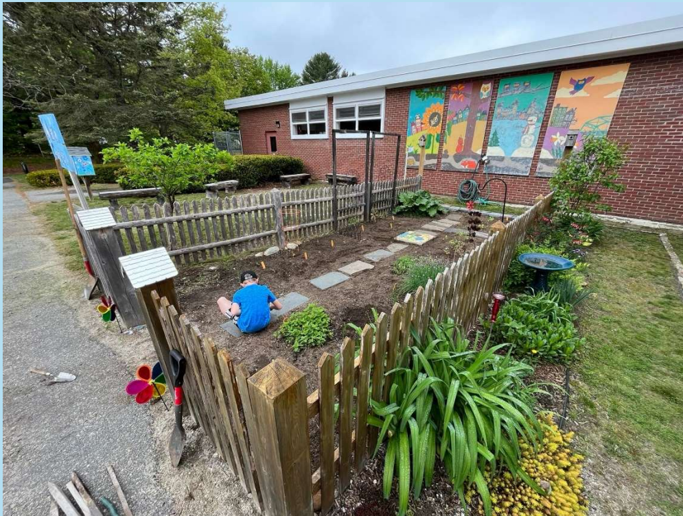
Pictured above is the WCS Garden

Lots of great things continue to happen throughout the WCS community. We are grateful for: