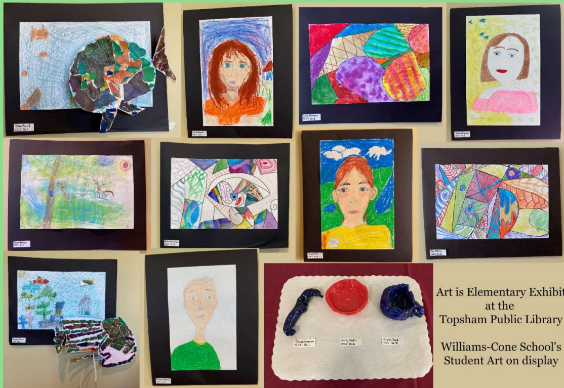
Art is Elementary Exhibit at the Topsham Public Library Williams-Cone School's Student Art on display